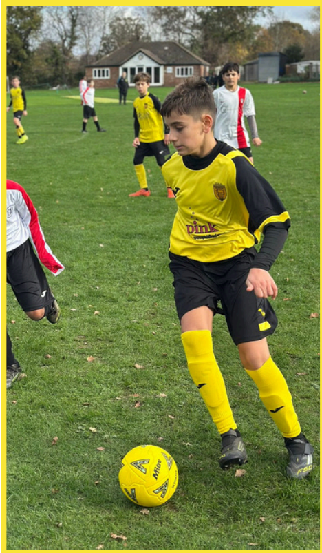
U12 IN ACTION AT HOME