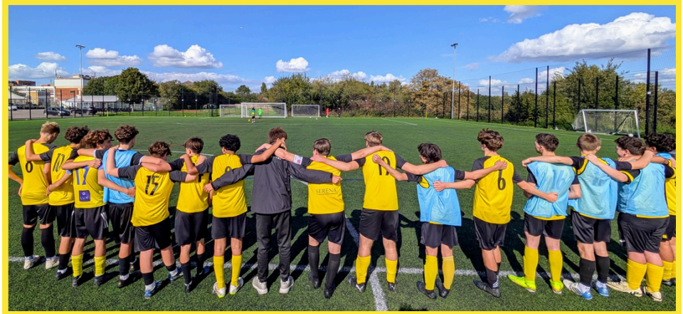
U16 WIN THEIR MIDDLESEX CUP PENALTY SHOOTOUT, 4-3