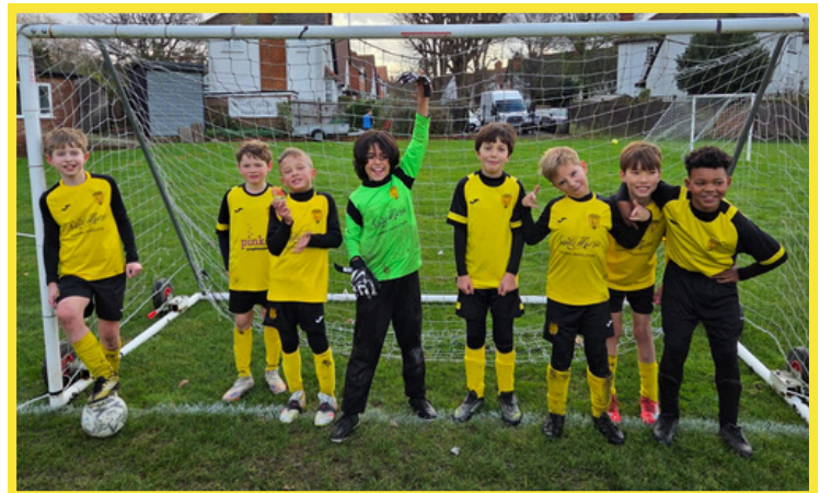
U9 CELEBRATE THEIR 5-3 VICTORY OVER LOCAL RIVALS NORTHFIELDS