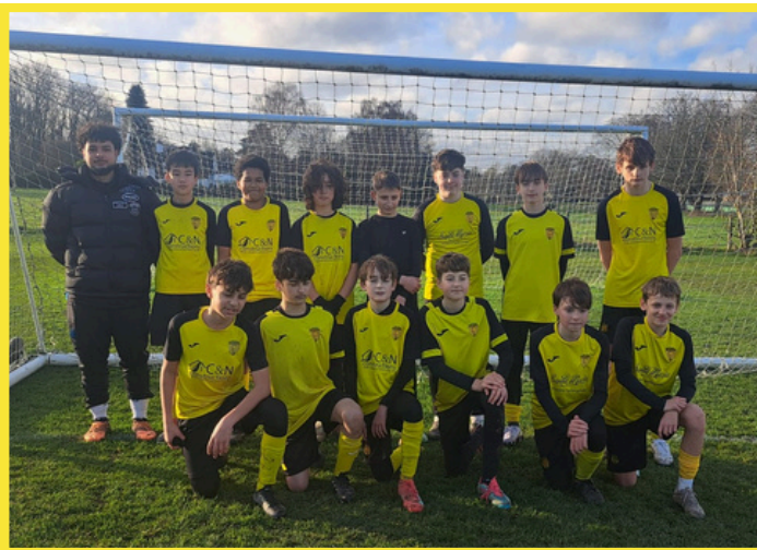
U13 AFTER A TOUGH 1-0 WIN VS NORTHWOOD