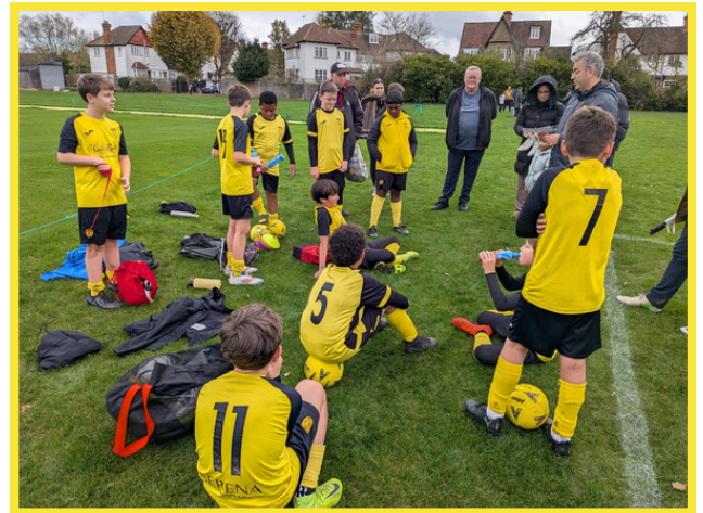
U12 TEAM TALK